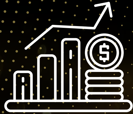
Banking, Finance and Fintech