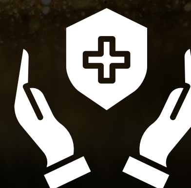
Insurance & Takaful