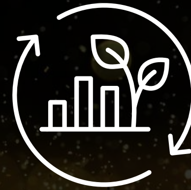
ESG & Sustainability