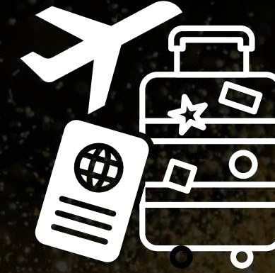
Travel & Hospitality