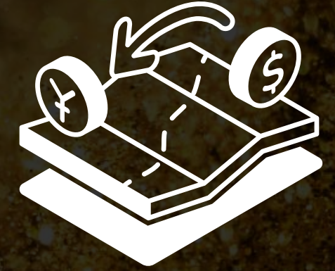
Brokerage & Forex