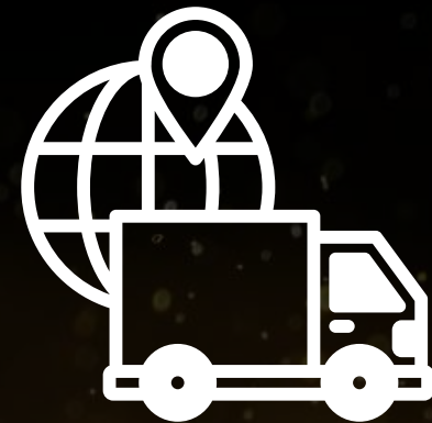
Logistics & Telecom